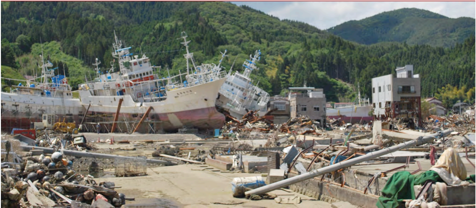
( Rikuzentakada, Japan in late June 2011)

On March 11, Japan was struck by a historic 9.0-magnitude earthquake, which triggered an extraordinarily destructive tsunami and partial meltdowns at three nuclear reactors. Due to the extent of the destruction, recovery efforts have been complicated but many are working hard to rebuild the affected communities' livelihoods, homes, and lives to bring back a sense of normalcy.